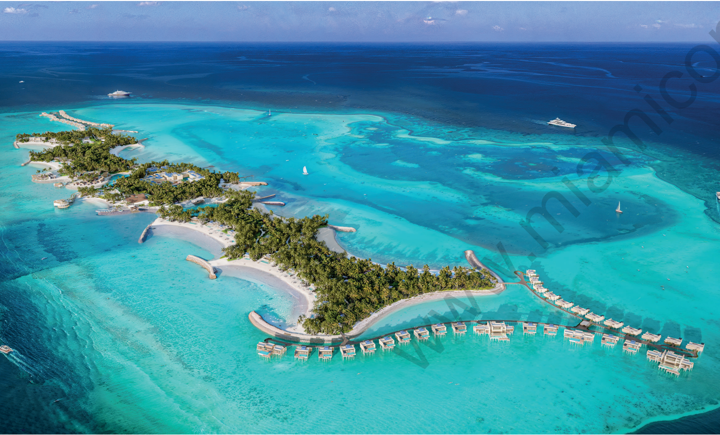
Mandarin Oriental, Maldives

Zaha Hadid Architects (ZHA) redefined architecture for the 21st century with a repertoire of projects that have captured imaginations across the globe. Creating buildings uniquely tailored to the communities they serve; ZHA has been awarded the highest honours from professional and academic institutions worldwide. Founded by Zaha Hadid, ZHA is one of the world’s most consistently inventive architectural studios—and has been for almost 50 years. ZHA’s architecture meets the aspirations of a new generation.