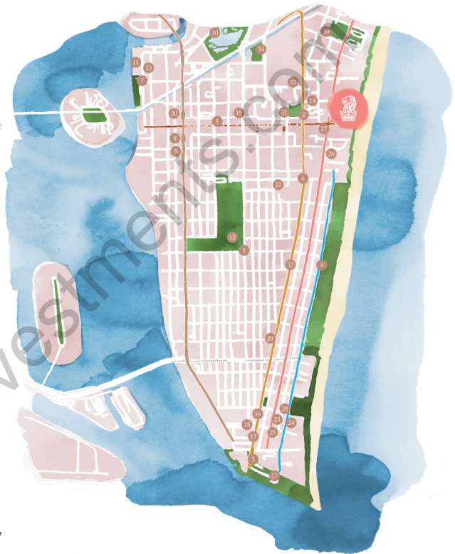
The Ritz-Carlton Residences, South Beach