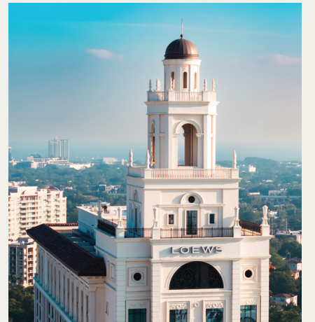
4. The Plaza Coral Gables