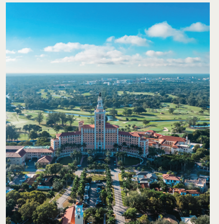
9. Biltmore Hotel and Golf Course