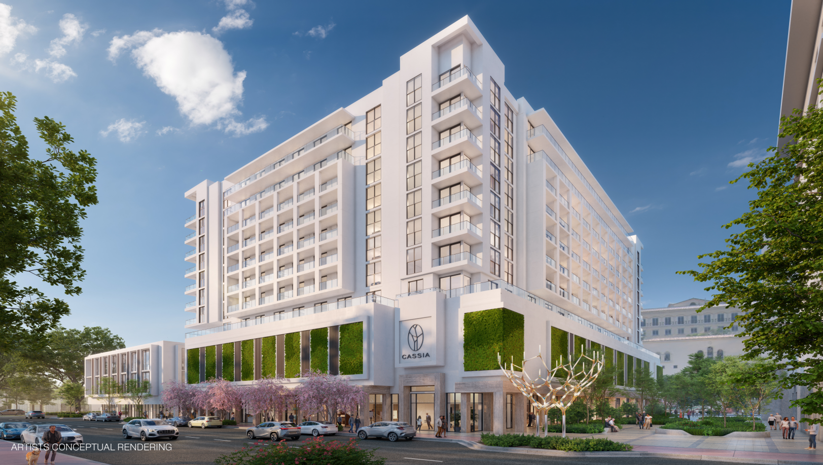
ARTISTS CONCEPTUAL RENDERING