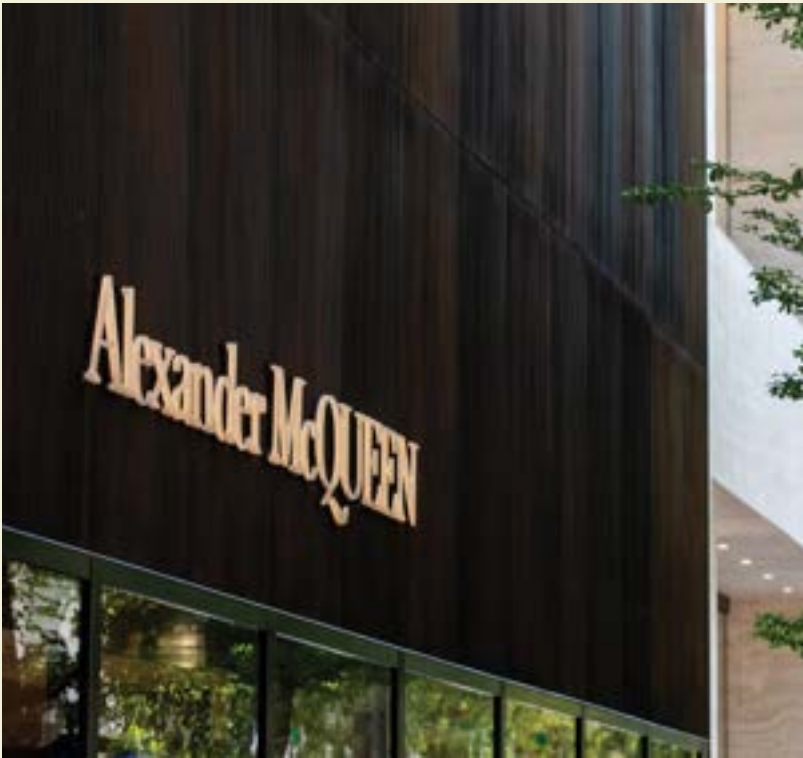
ALEXANDER MCQUEEN, DESIGN DISTRICT