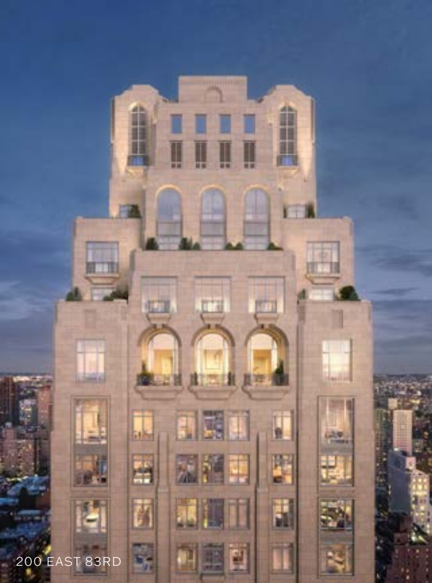
200 EAST 83RD