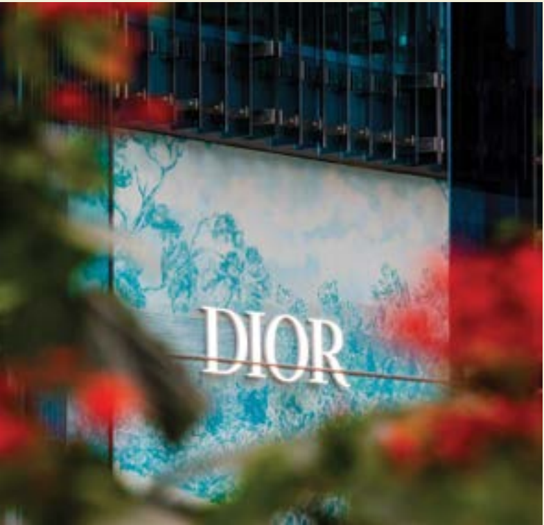
DIOR, DESIGN DISTRICT

From avant-garde boutiques to international designer labels, Miami is a mecca for shopping. There are so many trendy districts to meander through and standalone shops to seek out. In addition to the chic stores throughout Miami Worldcenter, favorites include pedestrian-friendly Lincoln Road, the locally owned shops of Sunset Harbour, the boho concept stores of Wynwood, the global luxury brands and contemporary design stores scattered throughout the Design District, and next-gen department stores The Webster and Faena Bazaar.