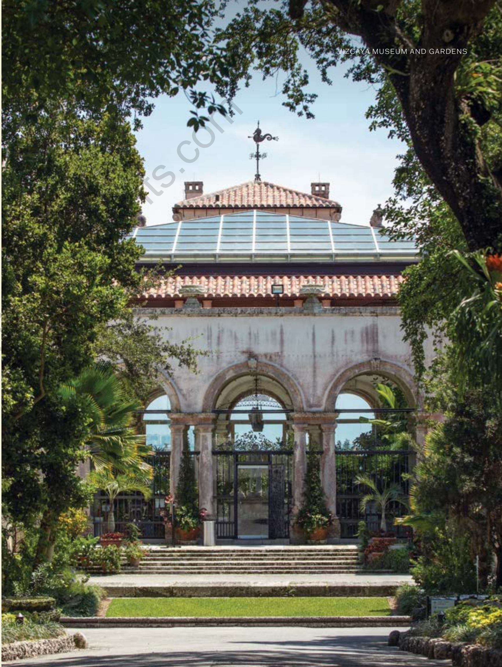
VIZCAYA MUSEUM AND GARDENS