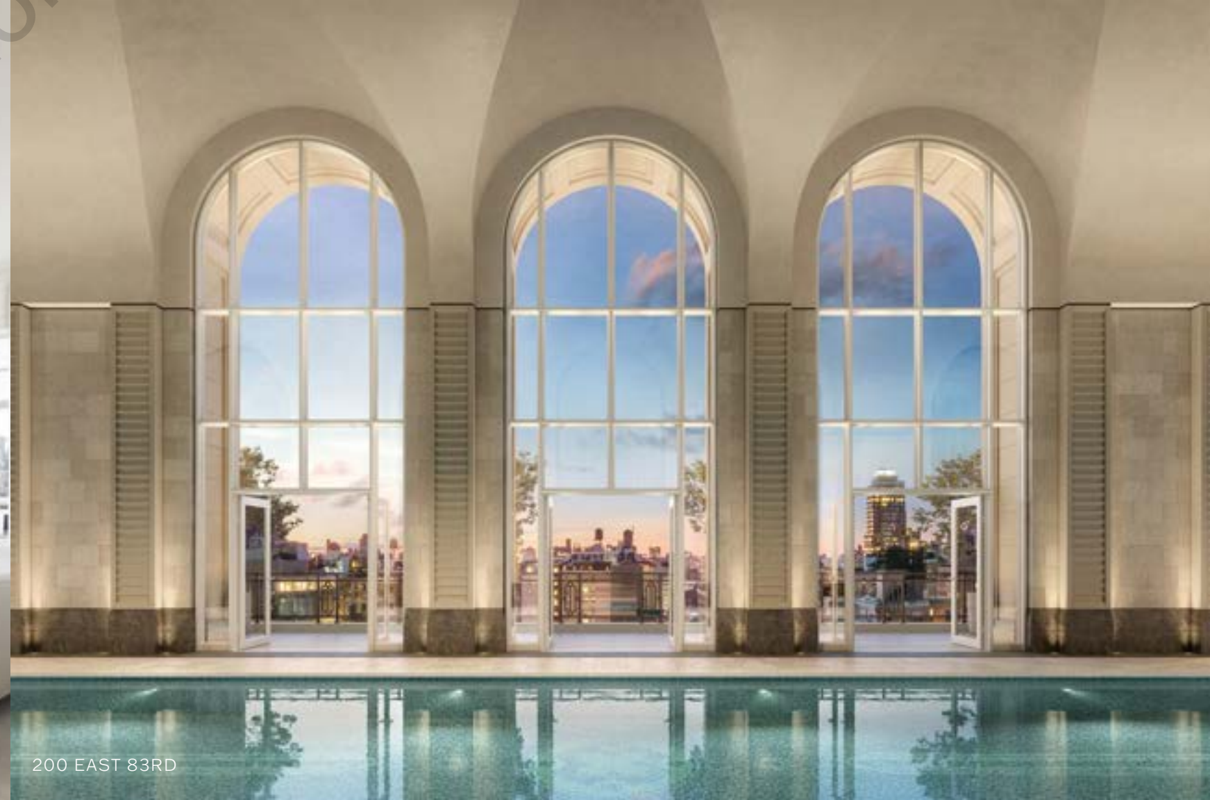
200 EAST 83RD