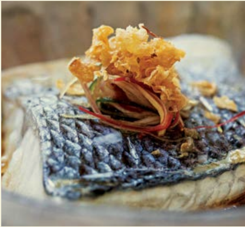
SEXY FISH MIAMI