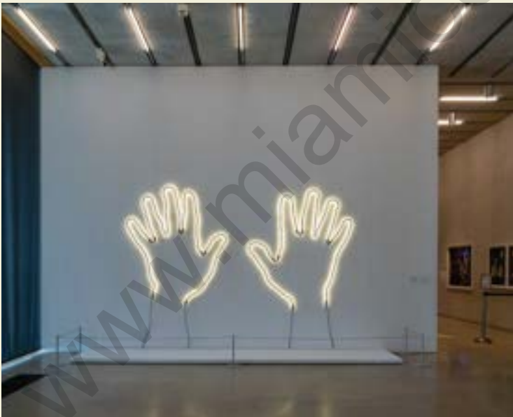
TOP: Wynwood Walls; MIDDLE: Penetrável Macaléia by Hélio Oiticica at Pérez Art Museum Miami; BOTTOM: Notes for a Poem on the Third World, Glenn Ligon, Pérez Art Museum Miami