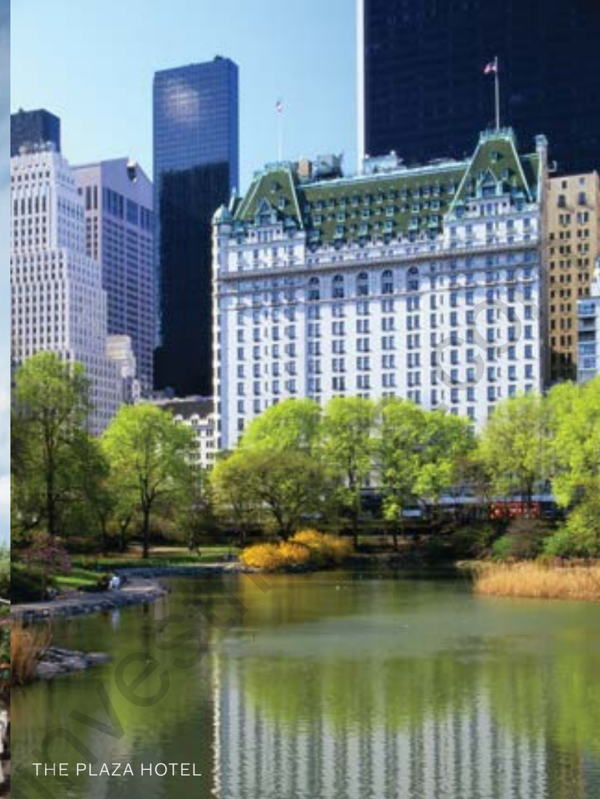
THE PLAZA HOTEL