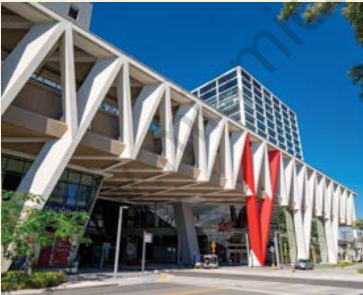
TOP: Miami Metromover; MIDDLE: Brightline; BOTTOM: MiamiCentral Train Station