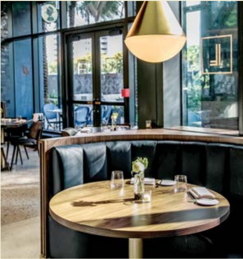
BRASSERIE LAUREL, MIAMI WORLDCENTER

Miami's ever-evolving dining landscape runs the gamut from local spots to acclaimed restaurants, serving cuisines as diverse as the people who flock to the city. Over a dozen Michelin-starred restaurants are within striking distance of JEM. When completed, Miami Worldcenter will be home to over 30 restaurants, including several from world-renowned chefs.