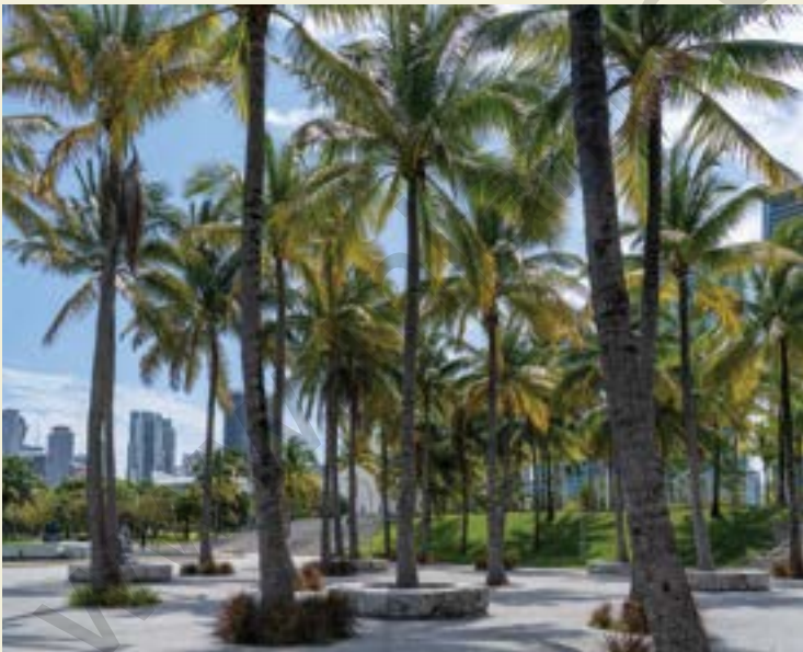
TOP: Miami Beach Golf Club; MIDDLE: South Beach; BOTTOM: Maurice A. Ferré Park Baywalk