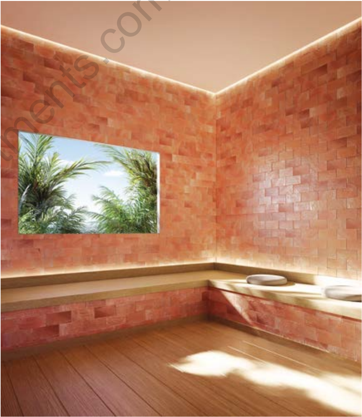
Composed of rare pink Himalayan sea salt, the salt room is inspired by a healing tradition rooted in natural salt caves in Europe, which are known for their healing and detoxifying properties.