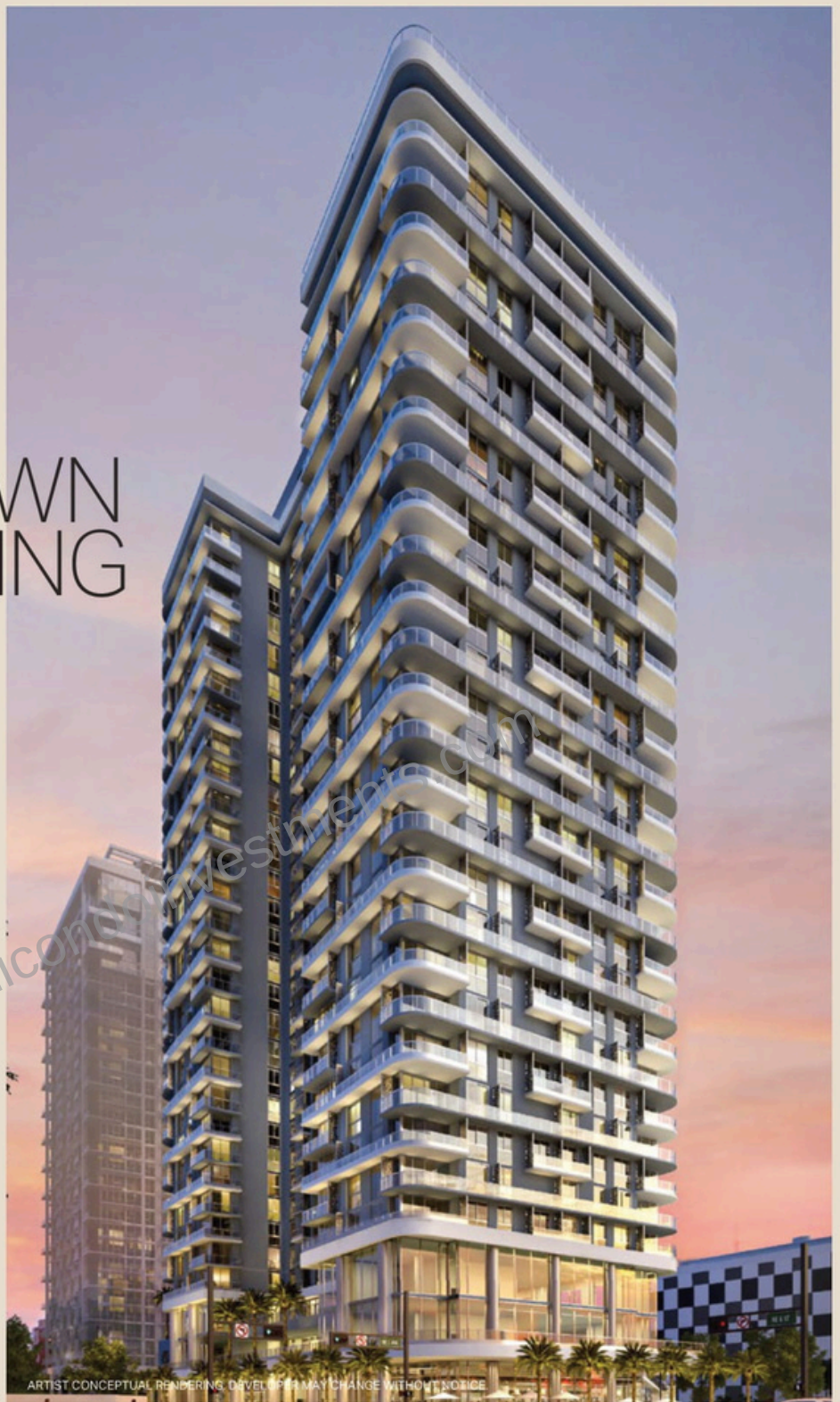
ARTIST CONCEPTUAL RENDERING. DEVELOPER MAY CHANGE WITHOUT NOTICE