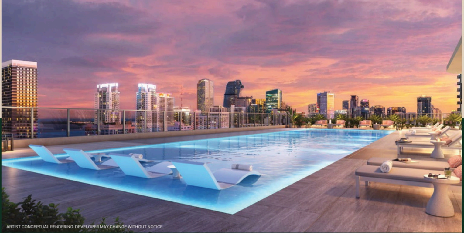
ARTIST CONCEPTUAL RENDERING. DEVELOPER MAY CHANGE WITHOUT NOTICE.