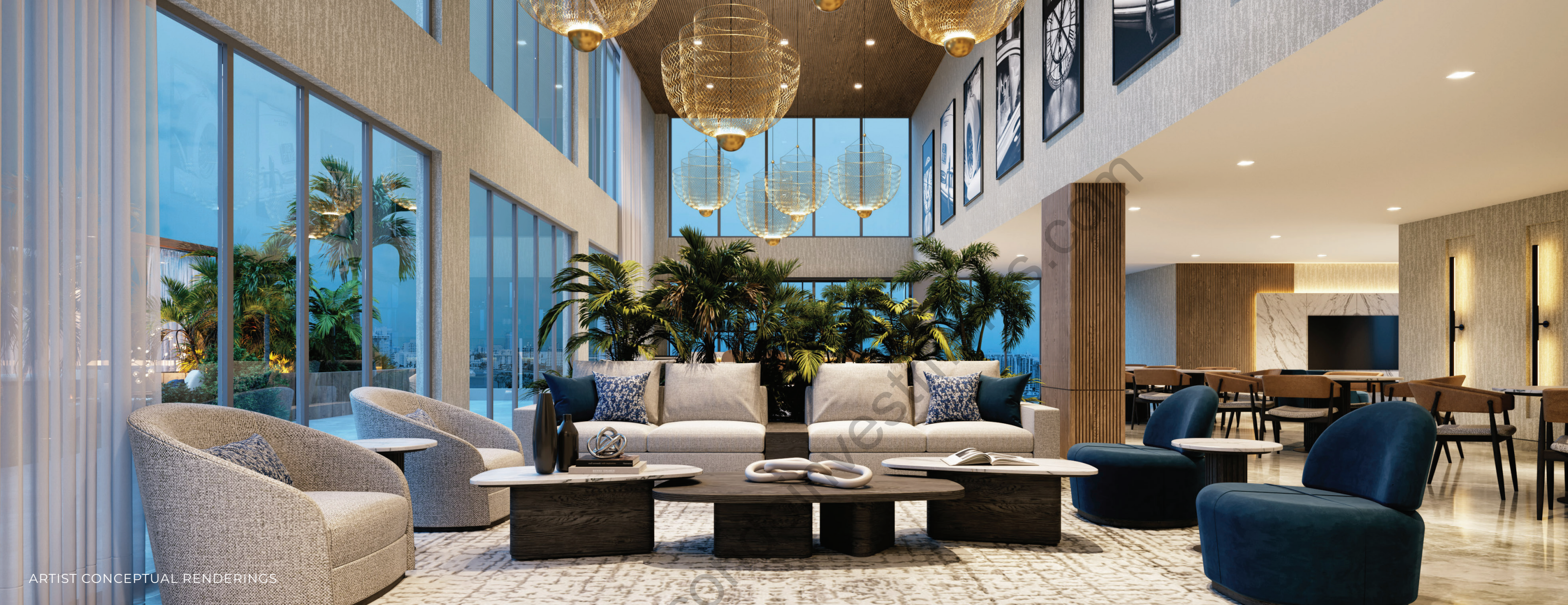
ARTIST CONCEPTUAL RENDERINGS