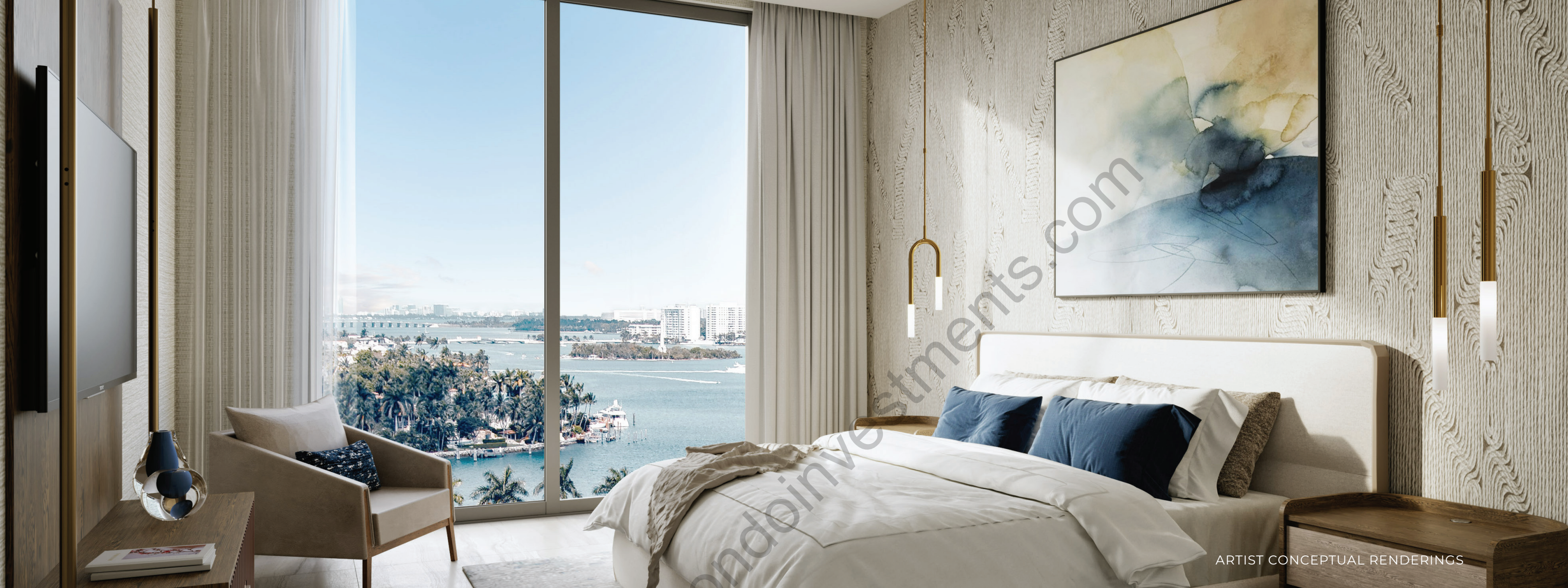
ARTIST CONCEPTUAL RENDERINGS