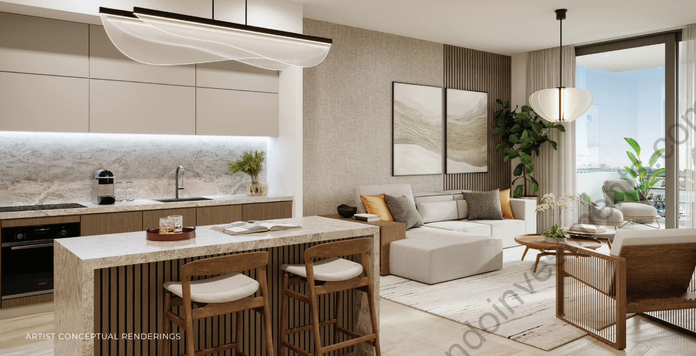
ARTIST CONCEPTUAL RENDERINGS