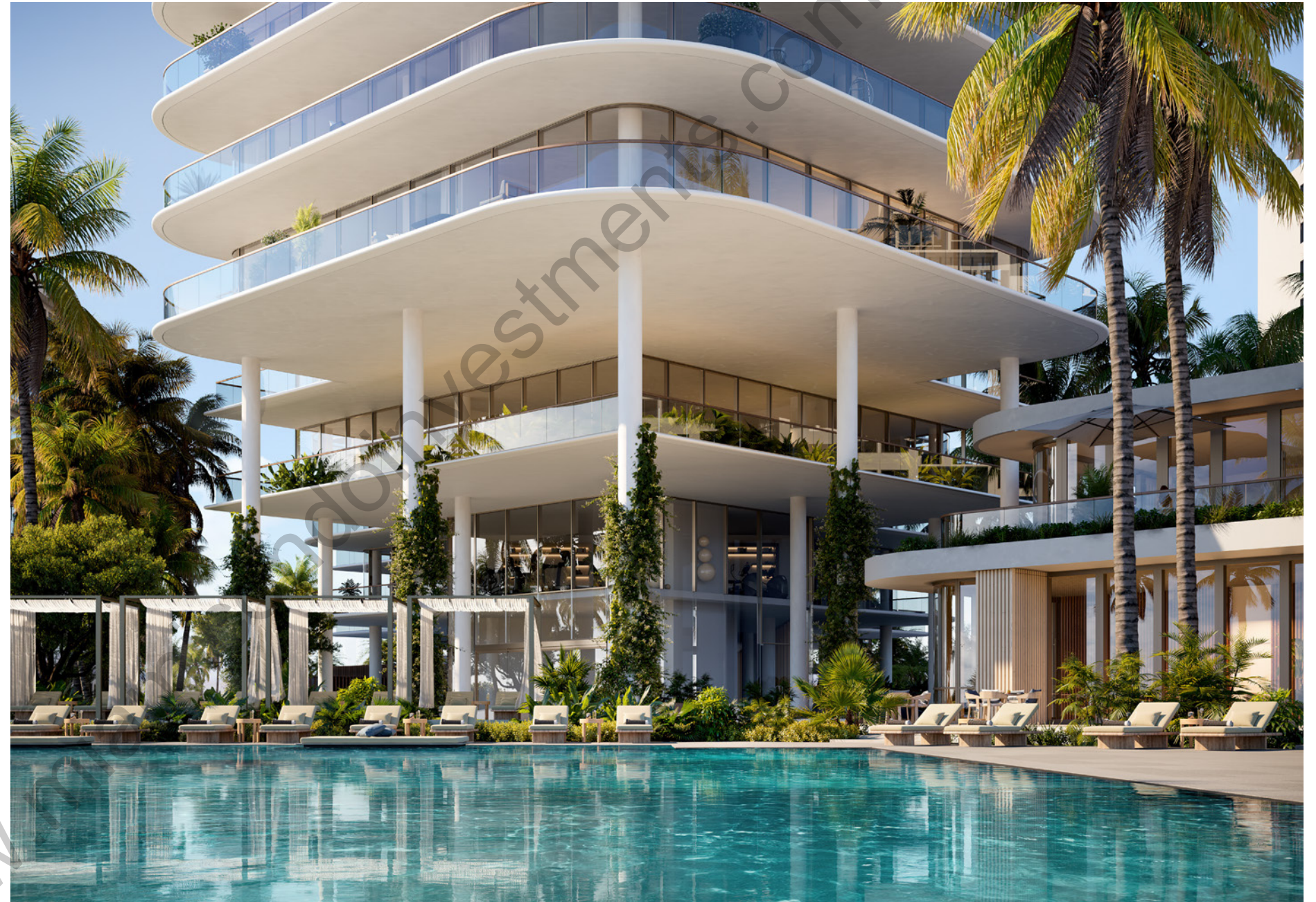
The beachfront swimming pool with private cabanas

Stepping outside, Gustafson Porter + Bowman has created a microcosm of Florida's landscapes through a series of interlinked habitats. Breeze-tussled coastal planting on the oceanfront transitions to a more tropical Everglades environment within via the dune-protected pool and striking water features.