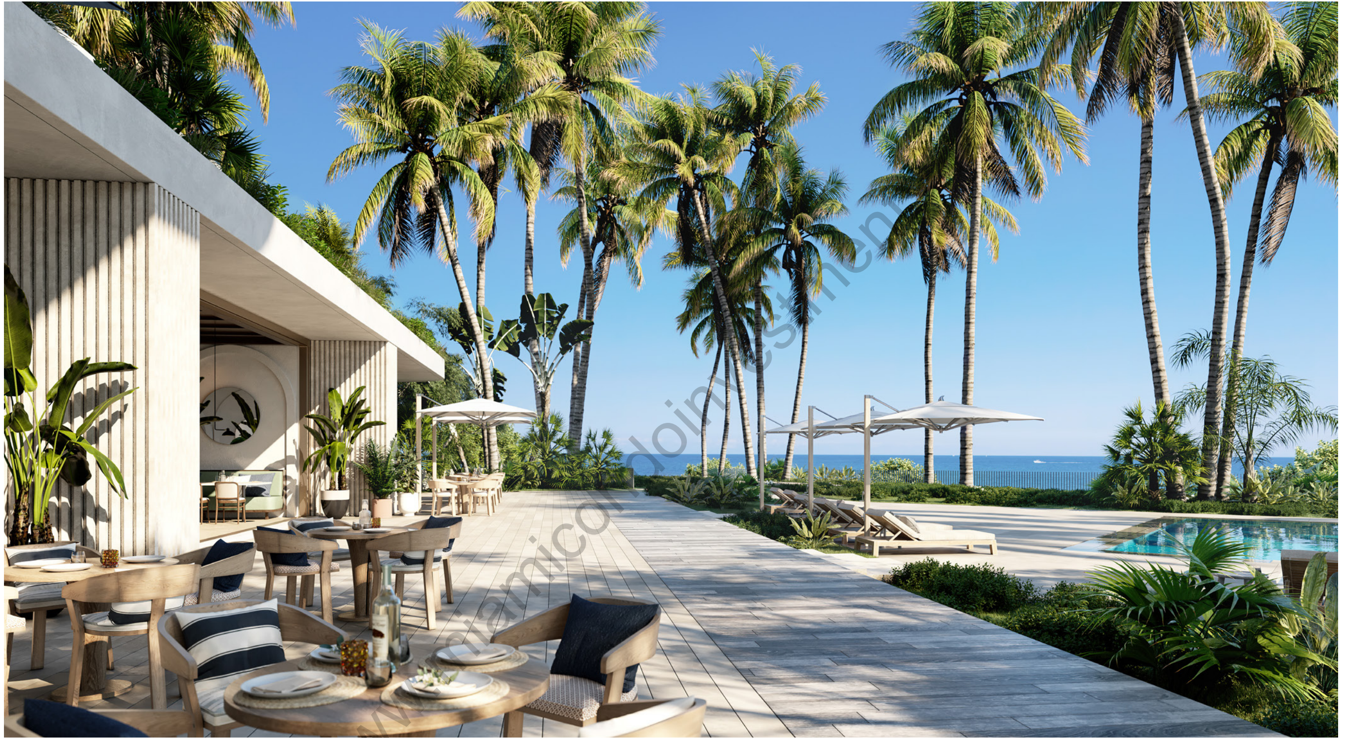
The oceanfront Restaurant is an exclusive enclave for residents and their guests