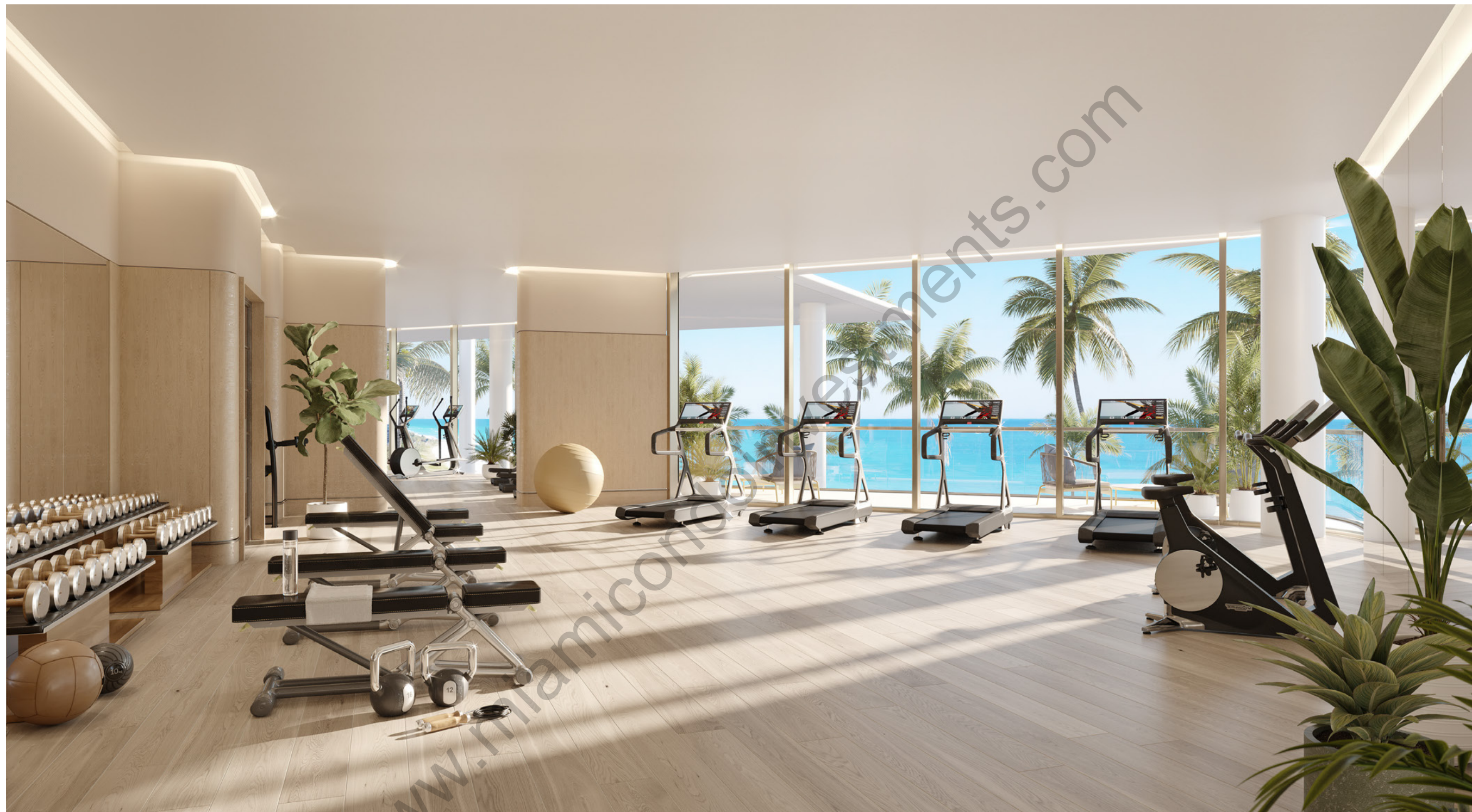
The Training Room with its inspiring views of the Atlantic Ocean