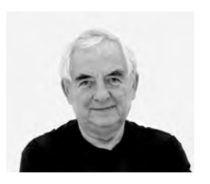
BRIDGE DESIGN DANIEL BUREN