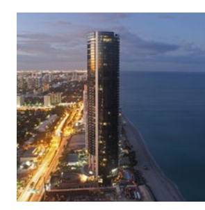
Porsche Design Tower