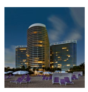
St. Regis Bal Harbour