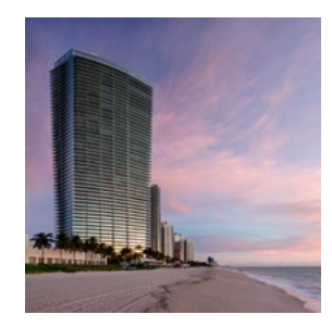
Residences by Armani/Casa