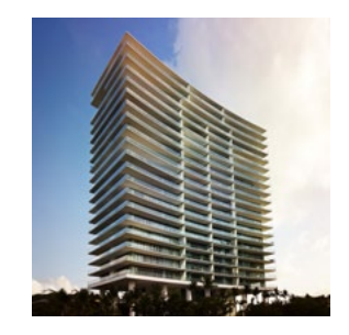
Apogee South Miami Beach