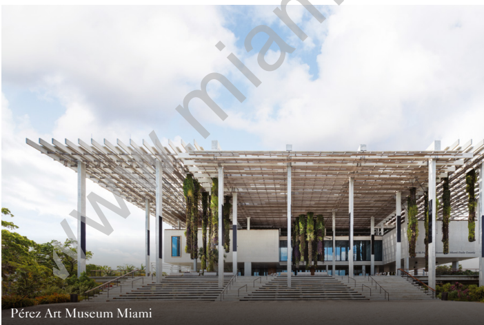
Pérez Art Museum Miami