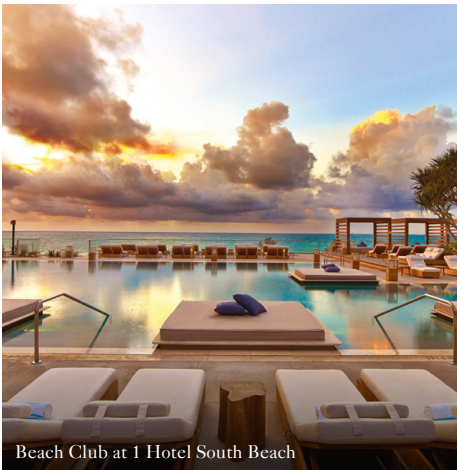
Beach Club at 1 Hotel South Beach

The private marina, planned riverside restaurant and lushly landscaped river promenade invite residents to spend hours and days luxuriating in the infinite energy and organic sparkle of life by the water. Watch the superyachts come and go, take a sunset stroll towards the bay, or head to a number of chic waterside restaurants courtesy of our private water taxi service. Residents can enjoy private membership and exclusive access to the Beach Club at 1 Hotel South Beach, SH Hotels & Resorts sister property. With loungers, beach towel services, cabanas, and seaside snack and beverage services, this waterfront community will cater to leisurely hours under the sun. Take a break from the hustle and bustle of the city and unwind with a cool drink in hand and the sand between your toes.