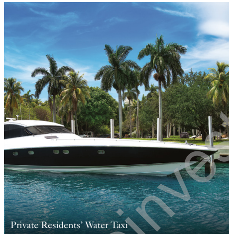
Private Residents' Water Taxi