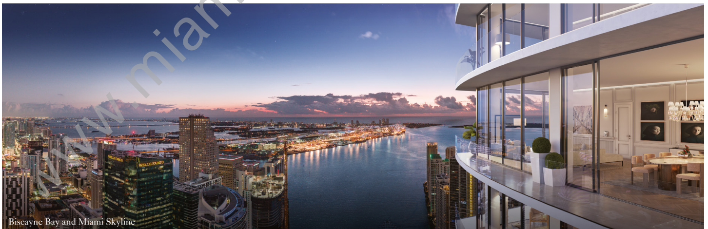
Biscayne Bay and Miami Skyline