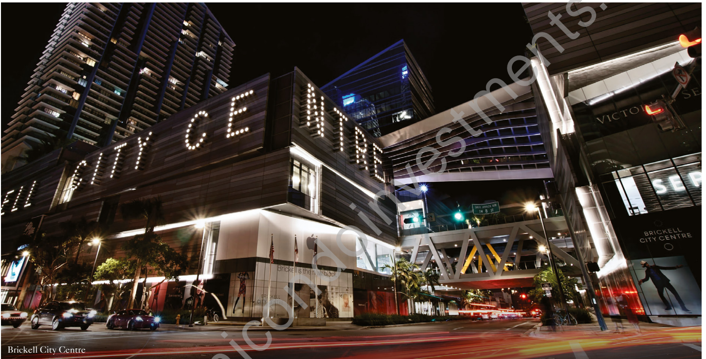
Brickell City Centre

Perfectly positioned at the entrance of Brickell Avenue, where the Miami River meets the beautiful blue waters of Biscayne Bay, and the bustling financial district blends with high-end shopping, top restaurants, cultural hot spots and exiting nightlife – this iconic neighborhood is an all-day all-night lifestyle destination, aptly named the Manhattan of the South.