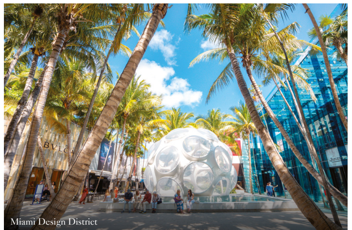
Miami Design District