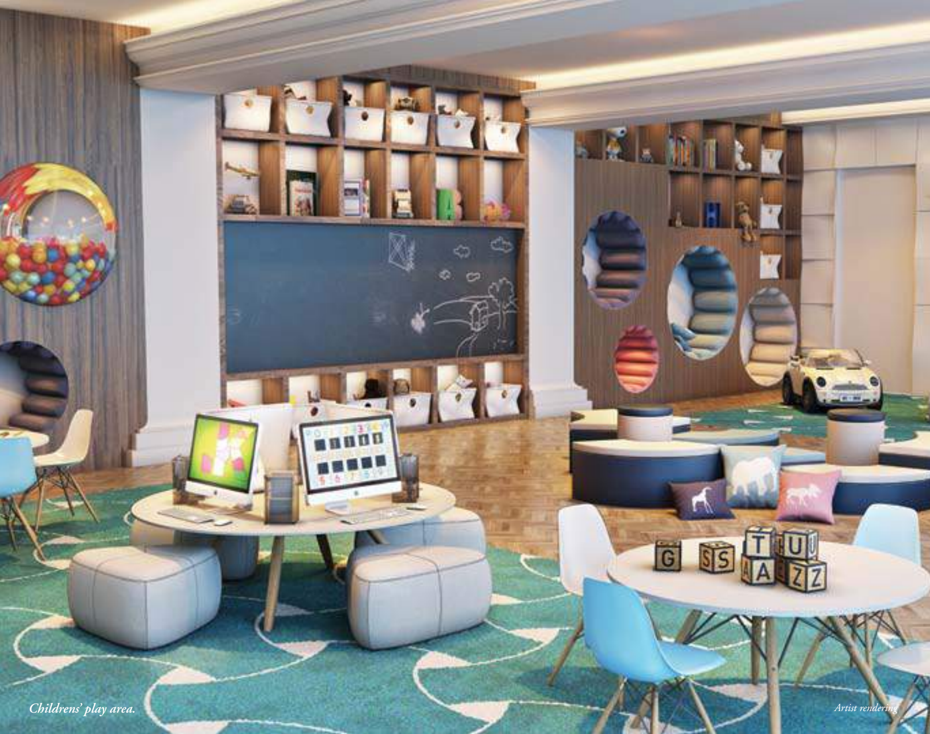
Childrens' play area.