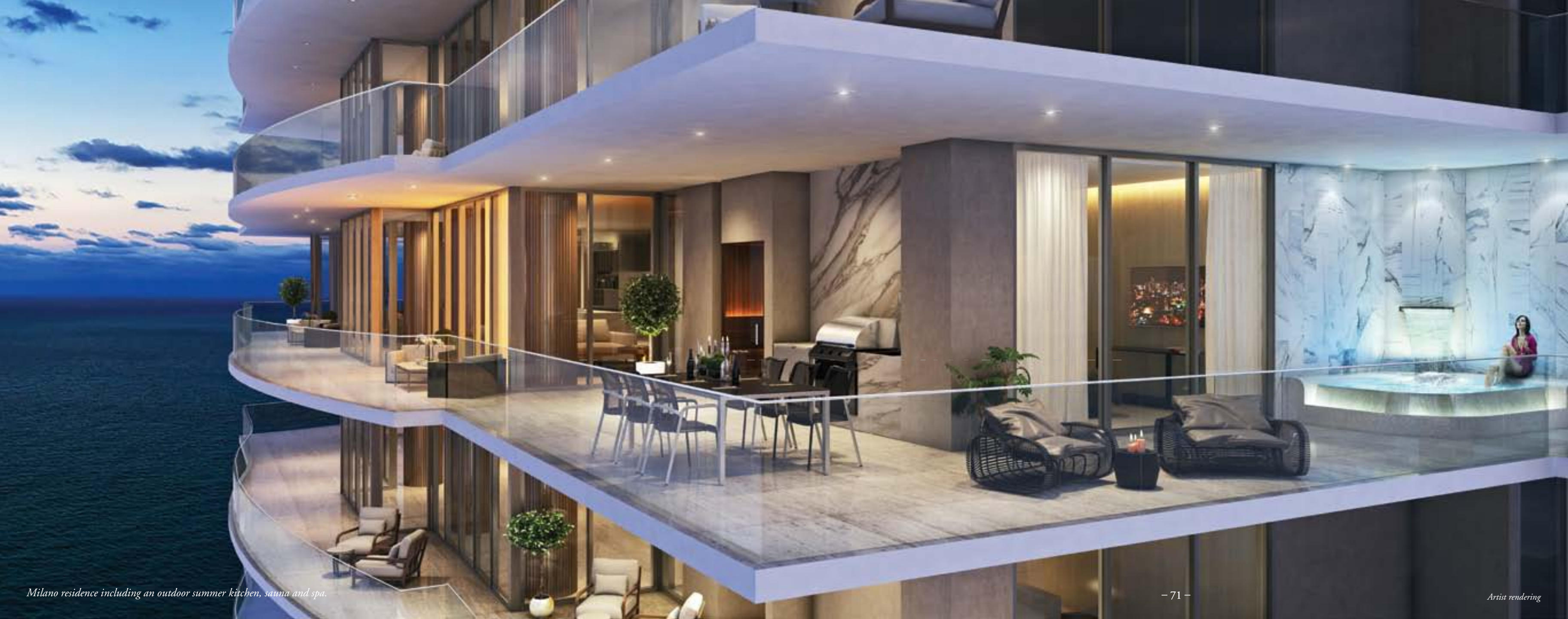
Milano residence including an outdoor summer kitchen, sauna and spa.