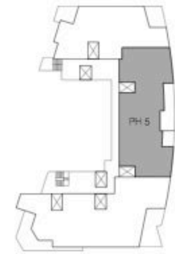
MIDDLE PENTHOUSE KEYPLAN