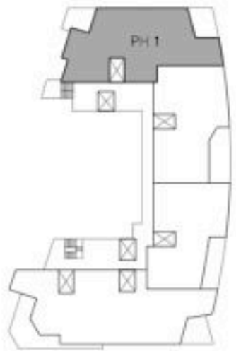
LOWER PENTHOUSE KEYPLAN