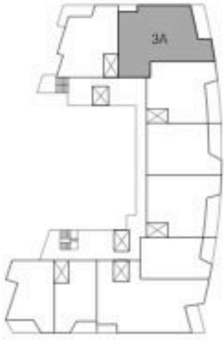
TOWER RESIDENCES KEYPLAN