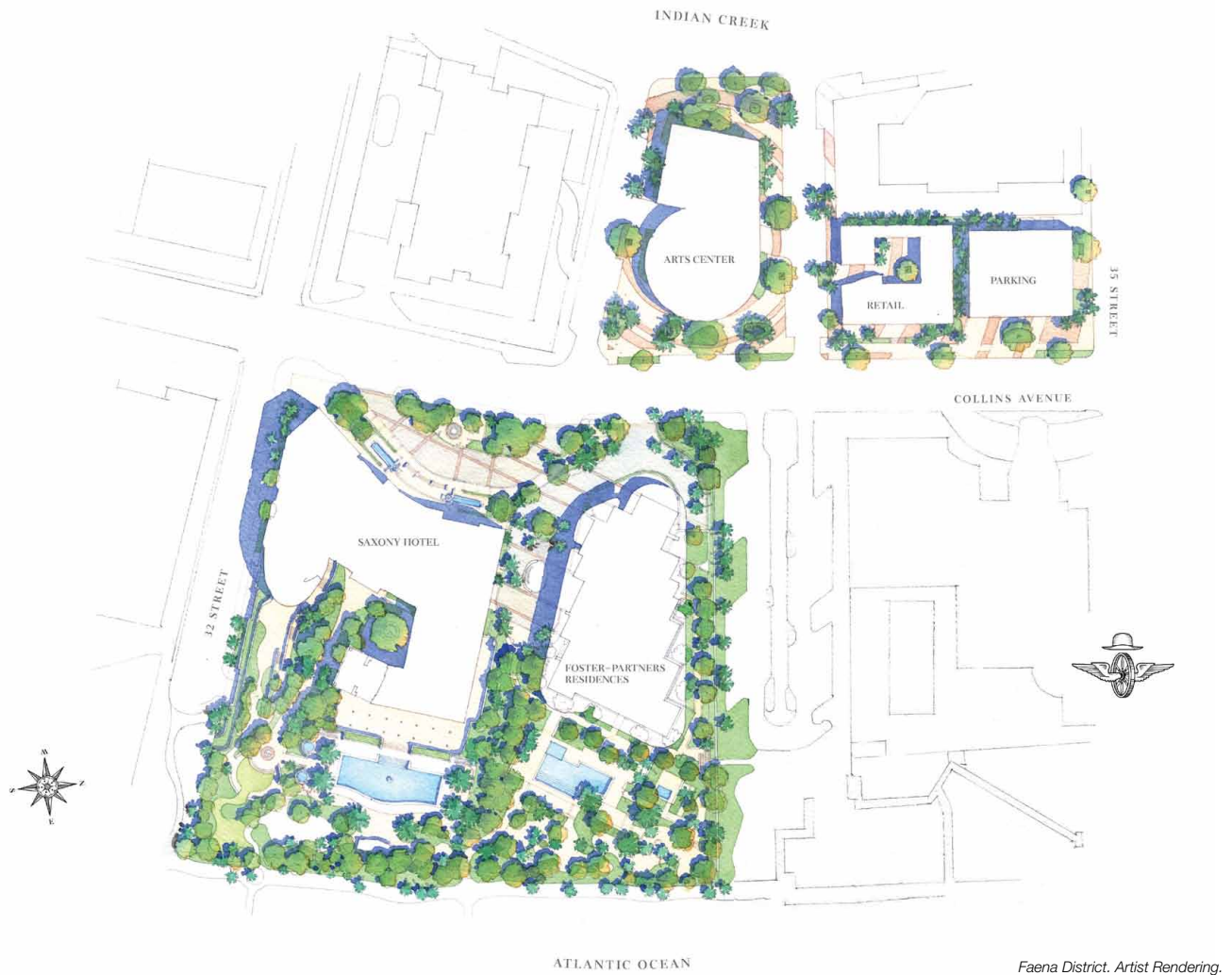
Faena District. Artist Rendering.