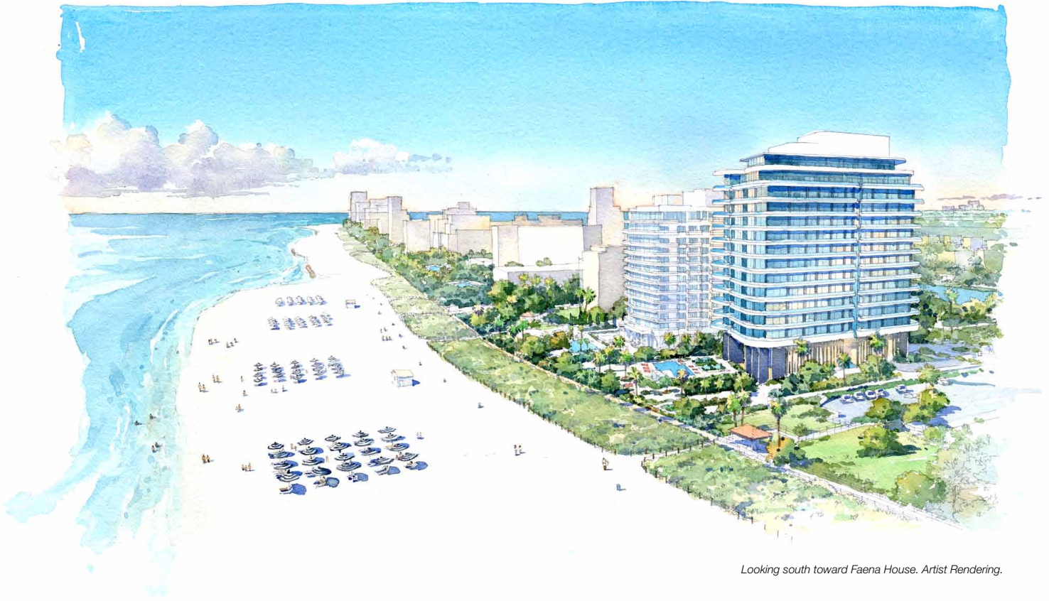
Looking south toward Faena House. Artist Rendering.